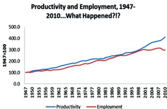
Figure 2. Productivity and Employment, 1947–2010. From Econfuture, http://econfuture.wordpress.com/ . Source: BLS.

unskilled workers have traditionally found jobs, giving rise to a permanent underclass of unemployment.