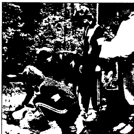
CzRC Youth learning First Aid

This comprises of a sex education programme concentrating on the prevention of the spread of HIV-AIDS. During the last year, 10 seminars were organized, in which 180 instructors participated.