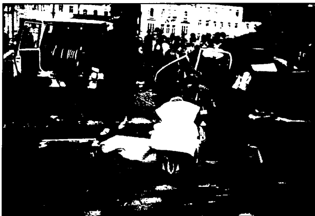
Providing First Aid after a traffic accident

Recently 1,131 new paramedical workers of the Czech Red Cross were recruited. These workers provide paramedical First Aid to almost 60,000 citizens every year.